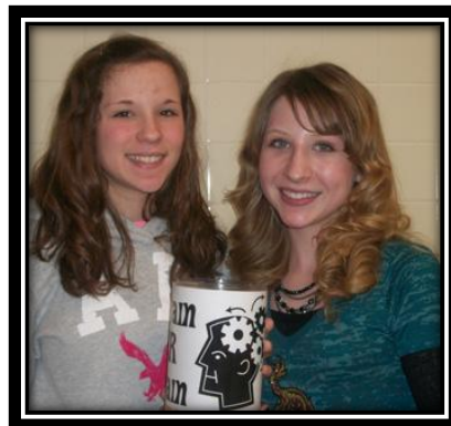
Our Strain UR Brain staff develops weekly challenges for our students related to math, science, reading, and more!