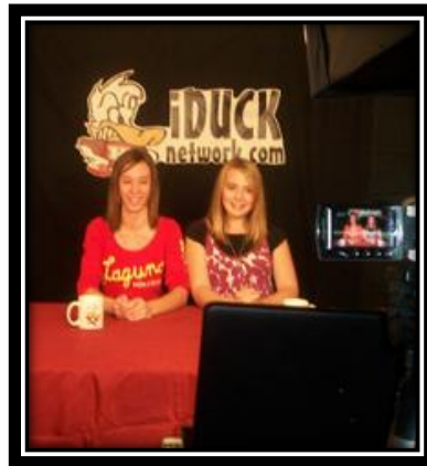
One of four anchor teams during the taping of a weekly newscast.