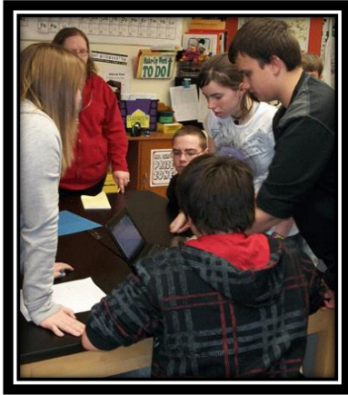
One of our news teams working on their script for an upcoming show.